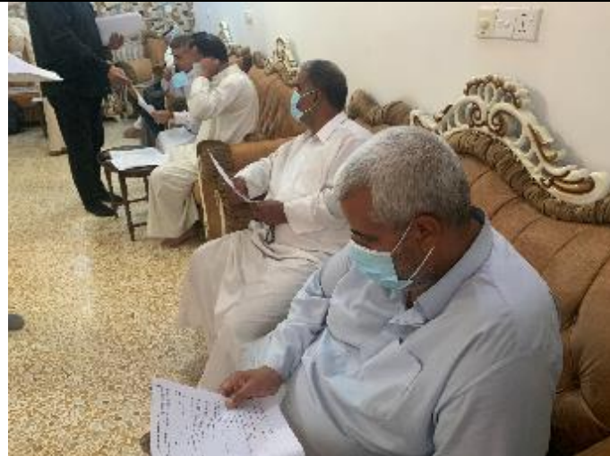
Public Consultations at ALBU NILE Village