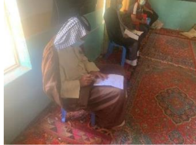
Public Consultations at AL-MEZAREEJ Village