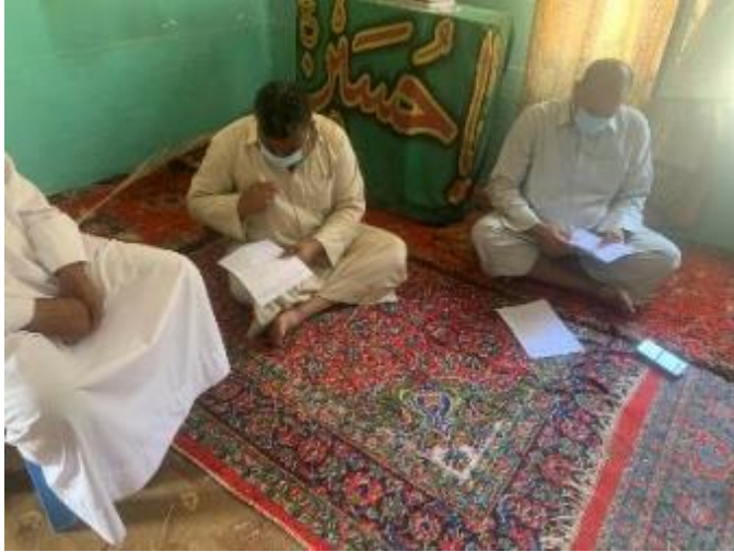
Public Consultations at AL-MEZAREEJ Village