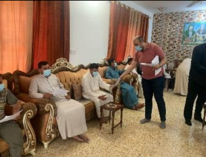
Public Consultations at ALBU NILE Village